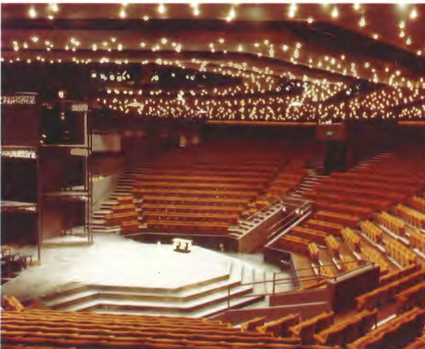
Sheffield Crucible Theatre, 1971, RHWL

Are the golden days of thrust stages over? Was it a trend that grew, flourished and then withered? Are people still building new thrust stages?