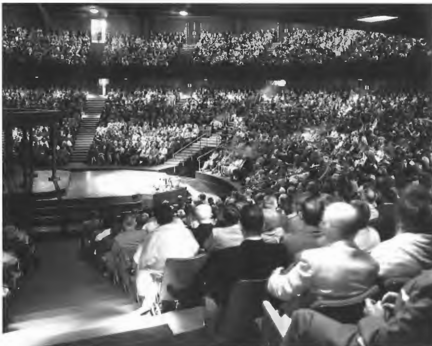
Stratford Festival Theatre, before the changes 1957

Stratford's first Artistic Director was well aware many audience members would see spectators on the other side of the stage from them and how this changes the nature of the theatrical "illusion" and the relationship between audience and the stage. In an article in Shakespeare Survey No 8, Guthrie noted, "I suggest that theatrical performance is a